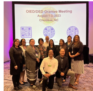
Above: DED planning team.

OIED convened grantees, Federal agencies, and Tribal organizations in Cherokee, North Carolina to support OIED grantees and the broader Tribal community in building connections and accessing economic development resources.