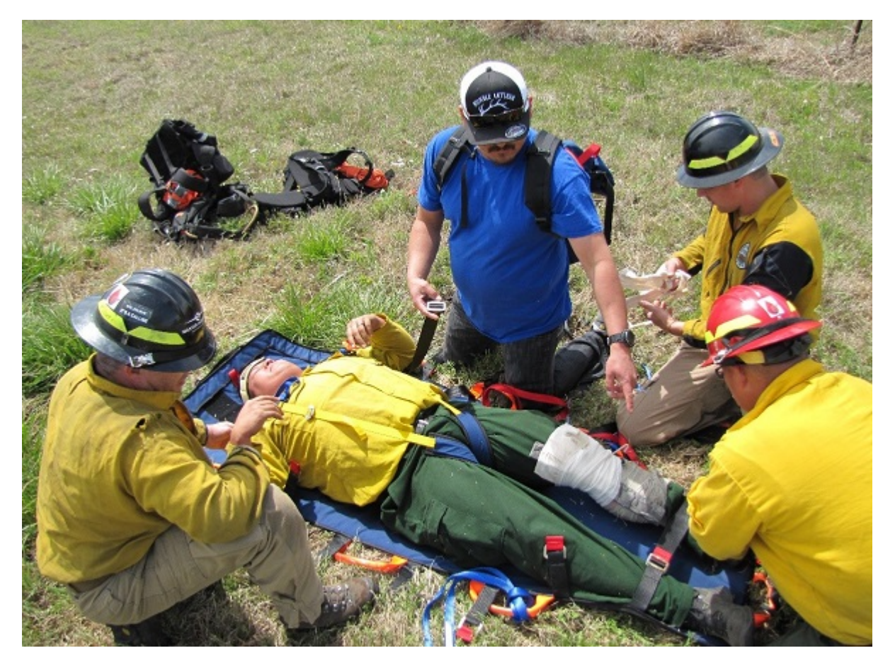
Firefighters practice giving first aid to a firefighter during a simulation in El Reno, OK.