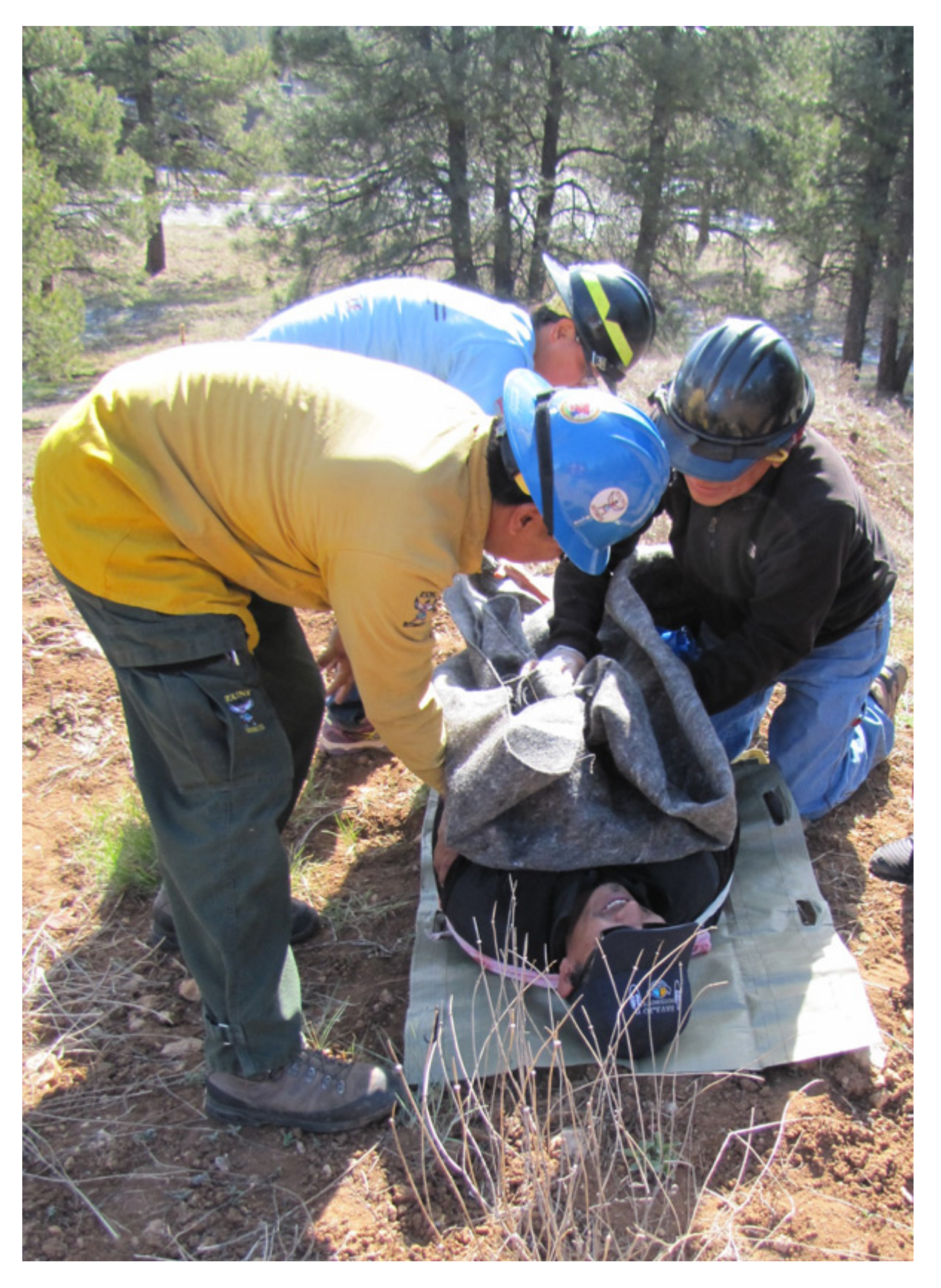
Wilderness first responders learn how to package a patient in the wildland fire environment.