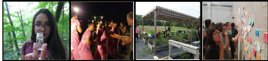
2019 Native Youth Community Adaptation and Leadership Congress