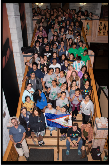
2019 Native Youth Community Adaptation and Leadership Congress

The Bureau of Indian Affairs' Tribal Resilience Program supports tribes in building resilience to meet the pressing and complex challenges Indian Country and Alaska Native Villages are facing. Youth are the next generation of tribal leaders confronting the challenges posed by rapid technology and environmental change. The resources provided are for tribal youth and emerging leaders come together to help build resilience through the next generation.