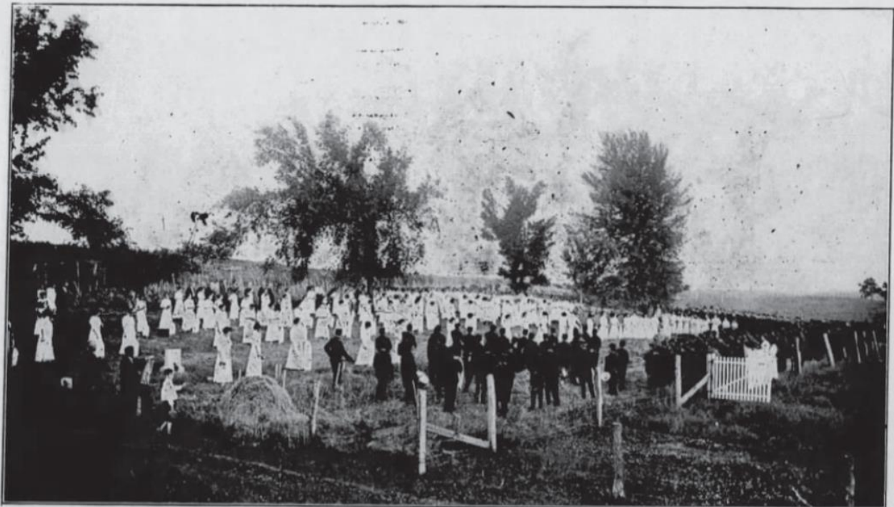
Annual Memorial Services, Haskell Cemetery.

The Department supports the OAC, United States Army collaborating with Indian Tribes, Alaska Native Villages, and descendants regarding the 180 human child remains buried at the Carlisle Barracks Main Post Cemetery consistent with specific Tribal practices for disinterment, continued safeguarding of child remains at the cemetery, or headstone modification.