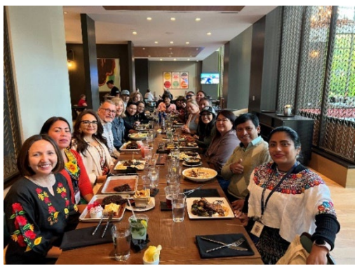
Indigenous tourism leaders at OIED's Grantee Meeting

Third, OIED served on the White House Council on Native American Affairs International Economic Development subcommittee. Through this collaboration, the OIED convened a first-ever Grantee Meeting that featured a workshop focused on Tribal nations connecting with Indigenous leaders from Latin America. The session was co-hosted by the DOI through the OIED and the U.S. Agency for International Development (USAID) through the Bureau for Development, Democracy, and Innovation