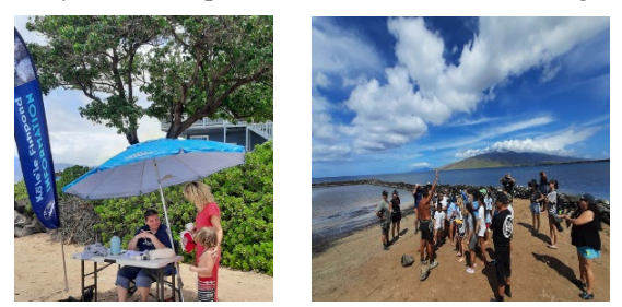
Both pictures: Kōʻieʻie Fishpond

experiences and fishpond revitalization opportunities for the community to engage with this important Hawaiian cultural and historical landmark in North Kīhei, Maui. With funding from the HO'IHI grant program, 'Ao'ao O Nā Loko I'a O Maui was able to continue restoring Kō'ie'ie Fishpond. The fishpond crew has been diligently working on restoring the fishpond's walls in the northern and southern sections and have thus far restored approximately 205 feet of the fishpond's perimeter. The outreach and education team regularly hosts school groups, community organizations, and visitors to provide educational