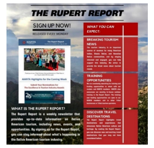
Informational flyer on the Rupert Report

• AIANTA hosted three town hall events shown in Table 2.4 for approximately 318 participants. The town halls provided an opportunity for AIANTA to share information and hear directly from cultural tourism professionals. Much of the information transmitted in FY 2023 focused on research to benefit Native nations and communities.