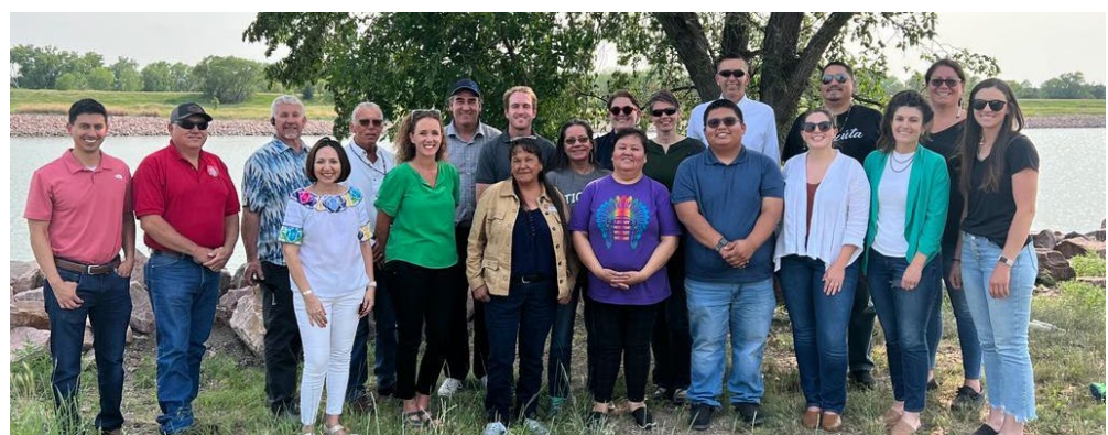
SDNTA Partners, Crow Creek Reservation, June 2023

In June 2023, the SDNTA initiated the process to transition into an independent nonprofit 501c(3) organization. By September 2023, the SDNTA had elected eleven Tribal Nation representatives to form the inaugural Board of Directors. The Board convened its first official meeting in October 2023, focusing on overseeing the finalization of bylaws, initiating the incorporation process, and undertaking the recruitment and hiring of a full-time field Project Manager.