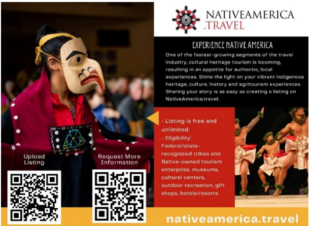
Informational flyer about the NativeAmerica.travel

In FY 2023, AIANTA improved the website by redesigning the home page and working with VisitWidget to complete an entirely new map and itinerary planning features. Internal upgrades to the website improved the navigation and page flow of the site, enhancing user experience.