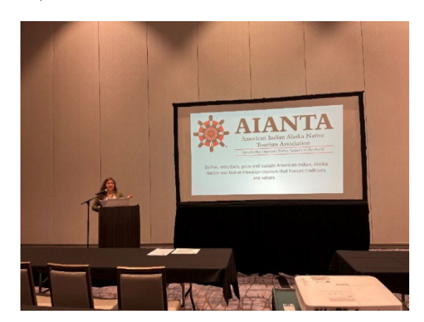
AIANTA workshop at the Grantee Meeting