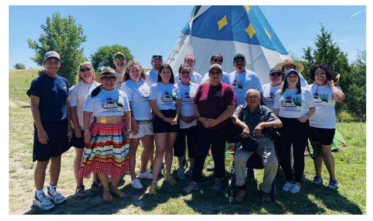
SDNTA Tour Testing Session, Lakota Youth Development Camp