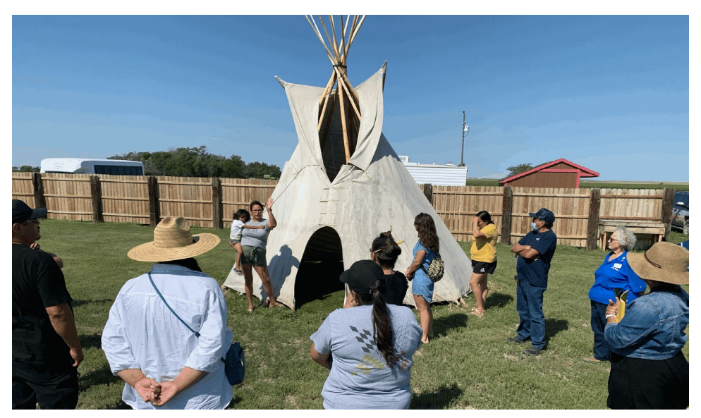
SDNTA Test Tour of Oglala Lakota Living History Village, Pine Ridge Reservation