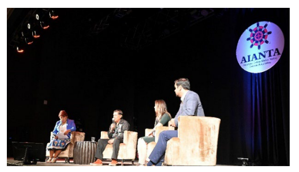
AIANTA hosting a panel at the American Indian Tourism Conference

To fulfill the first goal of the cooperative agreement,