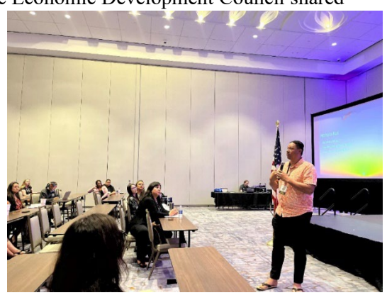
Hawaiian tourism presentation on E h \bar{o} 'ihi aku, e h \bar{o} 'ihi mai at the Grantee Meeting