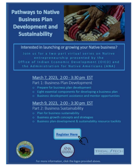
PTAP webinar flyer