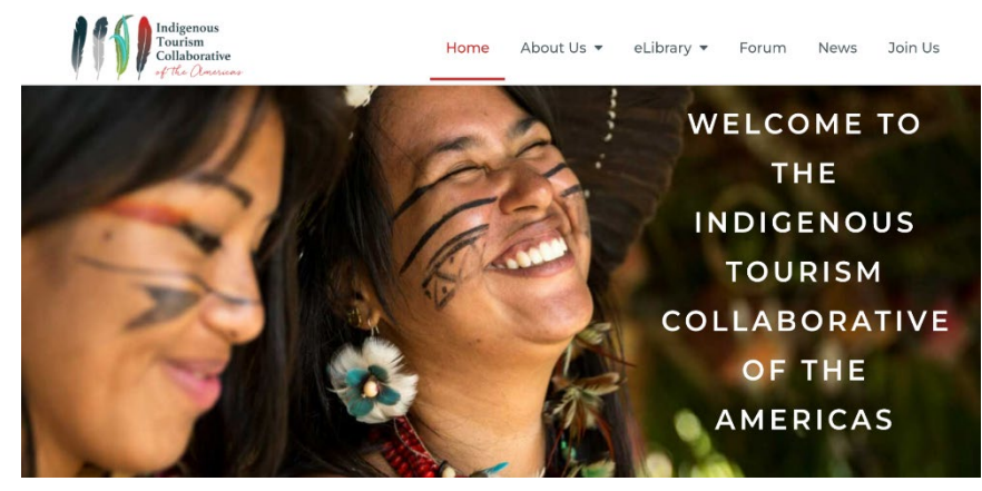
Indigenous Tourism eLibrary

In celebration of the International Day of the World's Indigenous Peoples, the ITCA launched its Indigenous Tourism e-Library in FY 2023, an easily accessible and comprehensive repository that features more than 500 tools and resources to help Indigenous peoples and their stakeholders and partners develop and better manage tourism. The eLibrary supports sustainable Indigenous tourism throughout the Americas (United States, Canada, Mexico, Central America, the