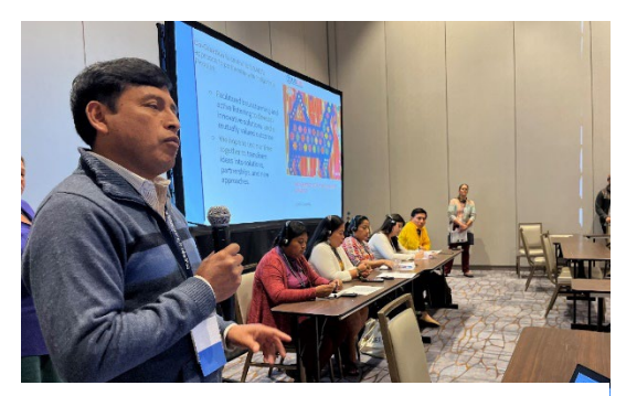
Grantee Meeting breakout discussion on Indigenous tourism