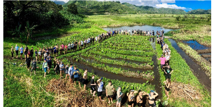
Visitors attend one of Kauluakalana's training and lo'i restoration workday at Kūkanono, Kailua.

(ancestral places) Best Management Practices. Activities are currently ongoing.