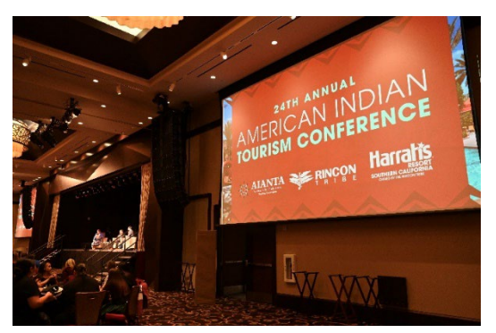
Stage view of AIANTA's American Indian Tourism Conference. October 2022

marketplace. Speakers from the industry provided training on building products, pricing products, working with tour operators, and working with the media.