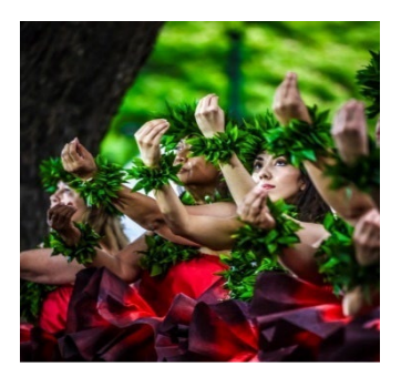
A hālau hula dances at the 46th Annual Prince Lot Hula Festival.

Funding received by the HŌ'IHI Grant Program has allowed PA'I Foundation to provide financial support to Native Hawaiian artisans to share, perpetuate, and market their products and services. The following artists, events, and organizations have been directly supported through HŌ'IHI grants: